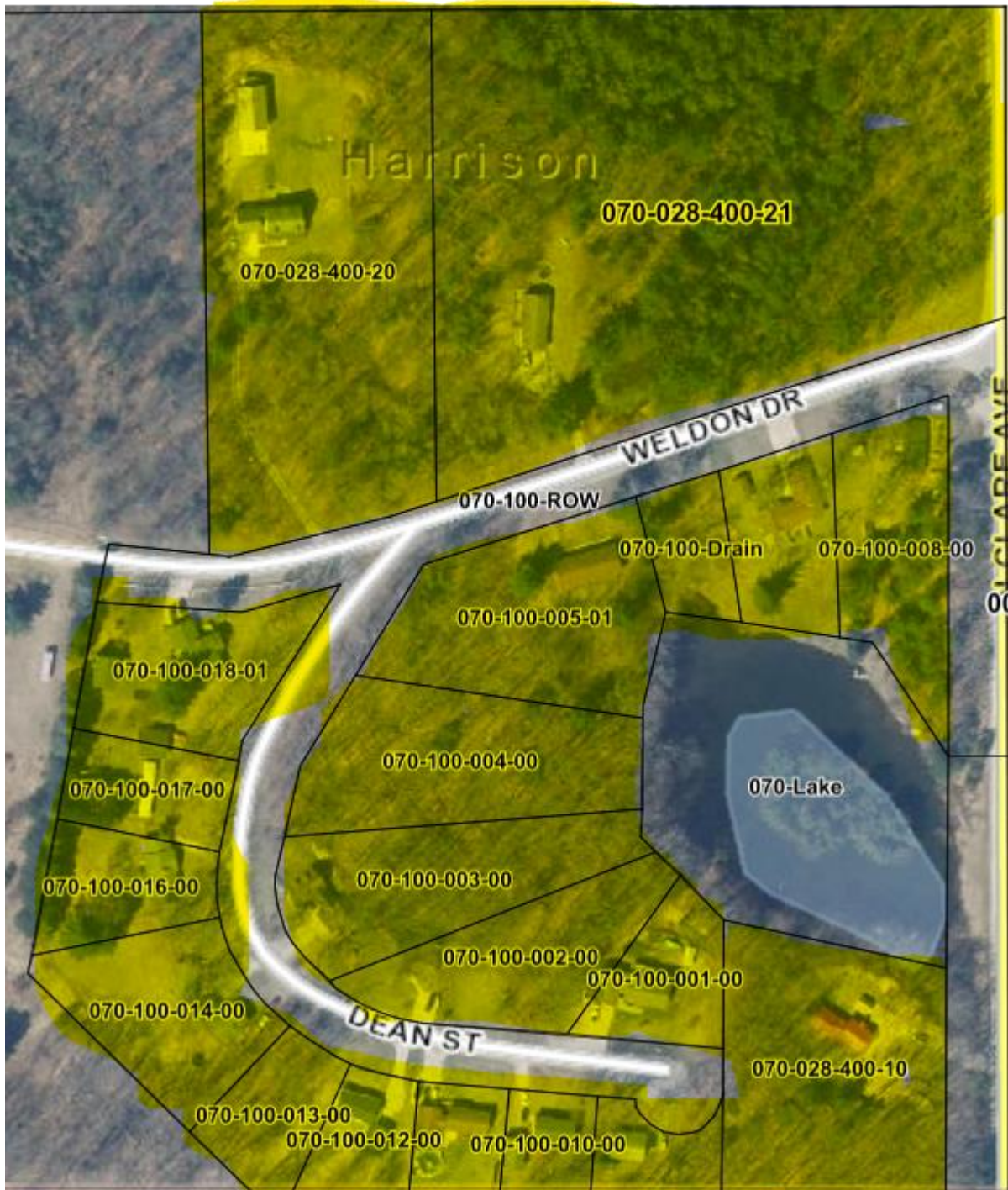
Exhibit B – Proposed NEZ District Map